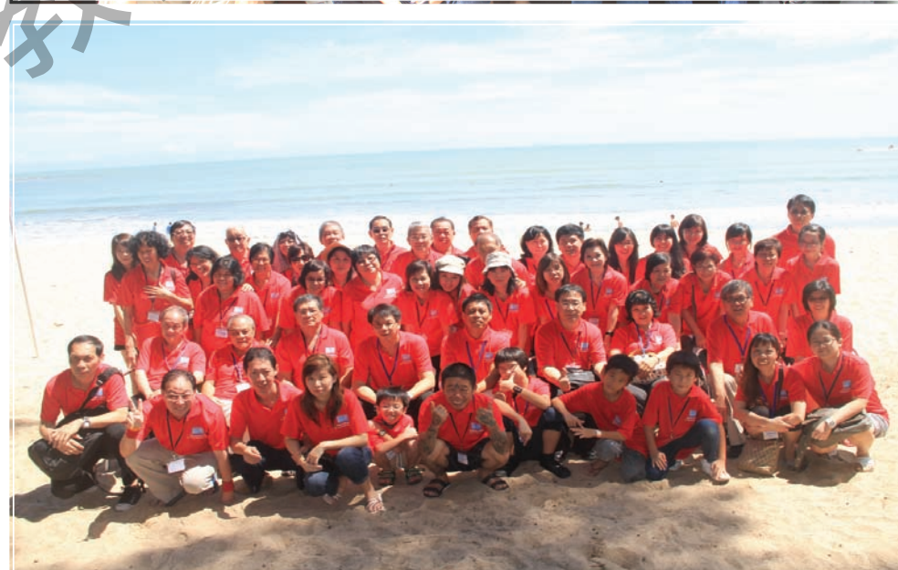
COSK Camp 2011 Campers 盛港教会圣经营的团员